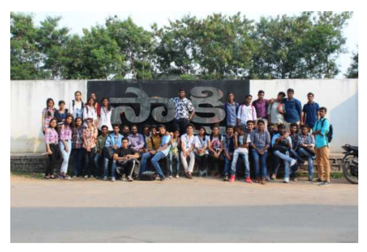
The First Year students of Department of BA at Sakshi Printing Industry (01/10/18)